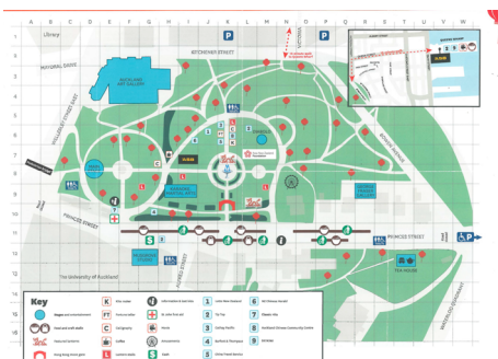
Fig. 3 Auckland Lantern Festival map 2014.

I would argue that Albert Park has been chosen because it is an elevated site within the city, a site that overlooks the city. It is not a site in a depression such as Aotea Square or Western Springs. It is a site of historical significance to the majority culture. It is a site located adjacent to major contemporary cultural institutions; the Auckland City Art Gallery, Auckland University and the Auckland University of Technology. During the festival it expands spatially into the university as people eat and meet in the University quadrangle and take tea in Government House grounds. There is further penetration into these adjacent institutions through performances, exhibitions and late night openings at the Art Gallery, the Musgrove Theatre and the George Fraser Gallery. Chinese presence occurs not just at the centre (that is within the park), but also at the margins.