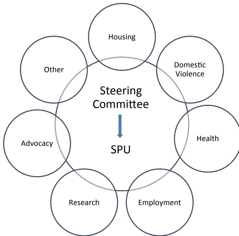
Figure 1. Possible structure for the collaboration model.

For instance, if the SPU would like to influence policies on a housing issue, it could work with non-profits that provide transitional or emergency shelters in West Auckland to collect information about the current state of housing and homelessness in the area, and some of the special issues that the West Auckland community is facing, and get recommendations on what would be the best solutions given the local context and demographic. The SPU would then get this information to feed into its submissions to the relevant parliamentary committee. It could also use the communication network to raise awareness about some of the unique challenges for West Auckland in terms of housing, and get more attention from the government. The SPU could also translate updated policies in housing and pass this information to the community through its communication network.