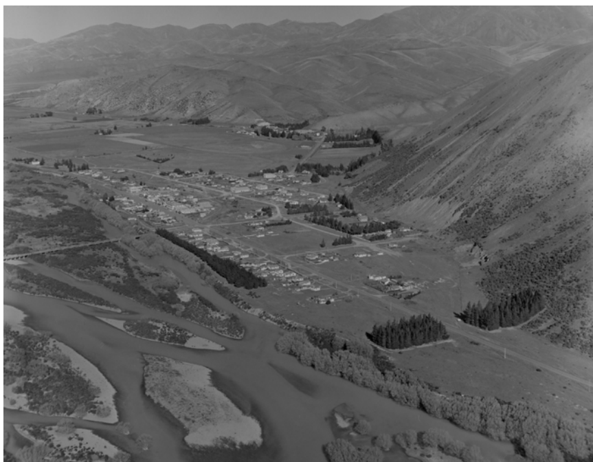
Kurow, Otago, including Waitaki River. Ref: WA-41477-F. Alexander Turnbull Library, Wellington, New Zealand. https://creativecommons.org/licenses/by/3.0/nz/legalcode

Based on what had been achieved, Dr McMillan presented a report to the New Zealand Labour Party conference in 1934. The system was a template for a New Zealand-wide health service. It was adopted in principle and was published as "A national health service: New Zealand of to-morrow." In 1935, both McMillan and Nordmeyer were elected to the first Labour Government; McMillan became Minister of Health. In 1941, Nordmeyer took over as Minister of Health and had to deal with a belligerent British Medical Association that denied the need for a health service. All three wise men of Kurow were committed to the principles of Christian socialism. Later, Savage proclaimed that his government's commitment to the welfare state was 'applied Christianity'.